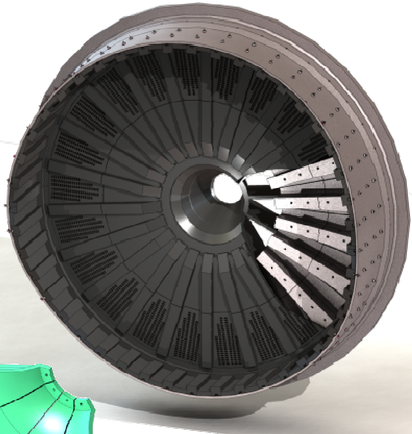
Rubber Lined Discharge End