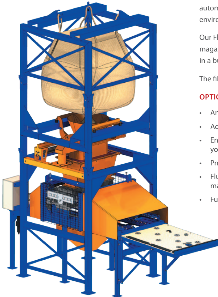
FLUX FILLER WITH 1000KG OVERHEAD BULK BAG

The Flux Filler has been designed to significantly reduce the incidence of elevated lead levels experienced by Fire Assay Laboratory workers—especially those directly involved in the preparation of samples for firing.